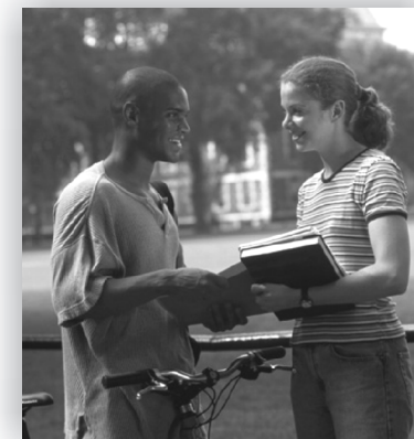
Scholarship Name List for Amputation